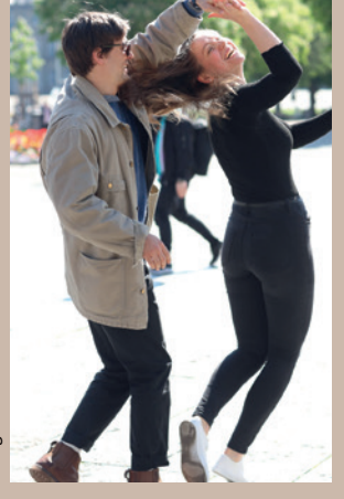
How do you perceive movement? What is my movement?

What is good for me? Where do I want to move?