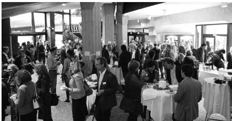
A new professional branch: Public Relations Representatives at the symposium «public engagement»

On 4/5 November the first symposium for communication, «public engagement», was held at the Waldorf school in Bochum-Langendreer. It offered an opportunity for nearly 180 participants to connect with the basics of public relations work and colleagues.